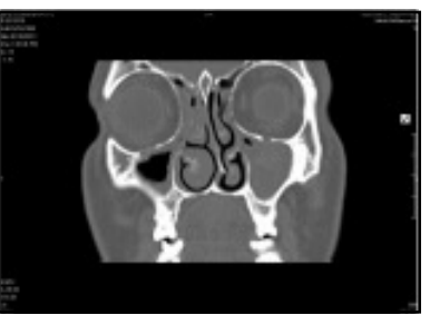
Fig 1. Coronal Section of Osteomeatal Complex Showing Mucosal Thickening of all the Sinuses, Deviation of Nasal Septum to the Left with Bony Septal Spur Impinging on the Inferior Turbinate and Atrophy of Left Turbinate along with Compensatory Hypertrophy of Right Turbinate

by disc diffusion test according to Clinical Laboratory Standard Institute which showed sensitivity to amikacin, trimethoprim-sulfamethoxazole, ceftriaxone and gentamicin, but resistance to amoxicillin-clavulanic acid, ampicillin, ciprofloxacin, erythromycin and doxycyclin. Patient was started on trimethoprim-sulfamethoxazole (TMP-SMX) for 6 weeks and improved gradually over the period of time.