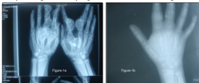
Fig.1a & b: Plain X-Ray in 1 st Patient Showing Central Geographic Expansile Bone Lesions in Tubular Bones of Both Hands & in 2 nd Patient Showing Expansile Bone Lesions in Short Tubular Bones of Hand with Mineralized Matrix

First case was a fifteen year old male patient presenting with a long history of multiple swellings in hands. These started some ten years before and progressed slowly. Swellings were painless and he did not complain of any other swelling anywhere in the body. There was no such history in his family. On examination multiple discrete, hard swellings were palpable in hands appearing to be bony in origin. Overlying skin was normal; no significant