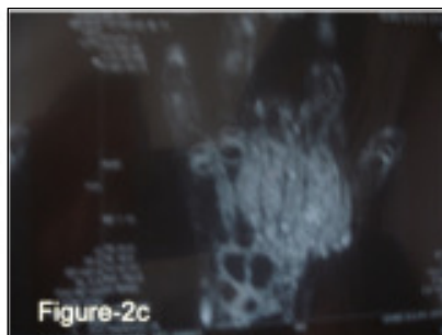
Fig.2a, b & c: Coronal T1W MRI Showing the Bone Lesions Isointense with Muscles. Axial T2W MRI Depicting Hyperintense Bone Lesions. Coronal STIR Showing the Expansile Hyperintense Bone Lesions Without Cortical Disruption

discrepancy in size between two upper limbs was appreciable. X-ray of hands was ordered which showed multiple central geographic lytic lesions in the tubular bones of metacarpals and phalanges in both the hands. The lesions were asymmetrically distributed ( Fig.1a ). Lesions were intramedullary and caused expansion of involved bones with scalloping of inner cortex. Small foci of calcifications were present in the lucencies. No cortical destruction was seen, no soft tissue component was seen around the bones. Carpal bones were spared; no definite lytic lesion was seen in the feet, legs, thighs, arms, pelvic or shoulder girdles. A diagnosis of Multiple enchondromatosis (Ollier's disease) was made based on the morphology and location of bone lesions on plain radiographs. Second case was 7 year old girl with two year history of swelling of hand bones on one side. Plain X-ray showed expansile bony lesions in metacarpal bones with lobulated contour and mineralized matrix. No cortical disruption was seen ( Fig.1b ). MRI in both cases showed homogenous high signal in a discernable lobular configuration on T2W SE images. T1W SE images showed lobulated intramedullary lesions with signal intensity approximating that of skeletal muscle ( Fig.2a,b&c ).