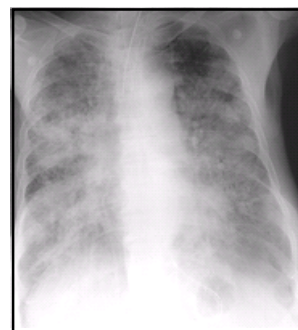
Fig 3. Diffuse Confluent Air-Space Opacities Involving Both Lungs & Normal Heart Size Compatible With Radiologic Features of Acute Respiratory Distress Syndrome

Myocardial lesions were observed in 80% of patients in one autopsy series (4). Interstitial myocarditis may occur in scrub typhus. Cardiomegaly, which may be due to myocardial or pericardial involvement in the infection (5-7), is usually reversible (1). Congestive cardiac failure is