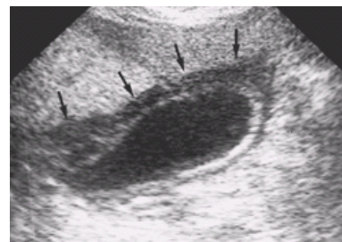
Fig 6. Longitudinal U/S Showing Gall Bladder Wall Thickening

Meningo-encephalitis of varying severity is seen in scrub typhus patients. Although central nervous system