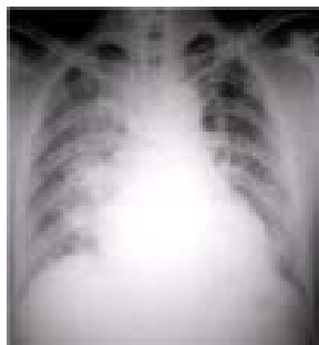
Fig 4. Chest Radiograph Shows Cardiomegaly & CHF another cardiac complication. Mixed pulmonary and cardiovascular involvement may be seen as- - Reticular infiltration and cardiomegaly - Reticular infiltration and congestive heart failure - Reticular infiltration, plus air space nodules and cardiomegaly/congestive heart failure - Cardiomegaly or congestive heart failure (CHF) plus air space nodules (Fig-4)