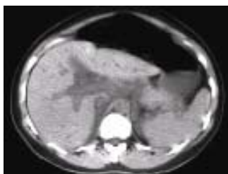
Fig 5. Unenhanced CT image of the Liver Demonstrates Periportal Edema (arrow) and Fluid in Morison's Pouch

Abdominal involvement is not uncommon in patients with scrub typhus. Radiographic findings of abdomen may be periportal areas of low attenuation in the liver, GB wall thickening, pericholecystic edema (Fig-5&6), splenomegaly, splenic infarcts and enlarged lymph nodes. The hepatic congestion and periportal inflammation that frequently occur in scrub typhus may cause relative obstruction of the hepatic vein outflow as well as compression of the portal vein with dilatation of the peribiliary plexus (8). Because of these hemodynamic changes, hepatic arterial flow may be increased and inhomogeneous early phase enhancement therefore may occur (8). This appearance of the liver at dynamic contrast-enhanced CT in patients with scrub typhus is similar to the pattern noted in other liver diseases like liver cirrhosis, Budd-Chiari syndrome, hepatic congestion, acute cholangitis/cholecystitis & abscess.